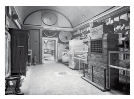
Antiquarium, room II, 1914 (Archivio Parco Archeologico di Pompei, C 665)