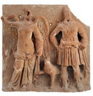
Floral frieze with gods and cupids Mid-2nd - early 1st century BCE Terracotta Insula Occidentalis