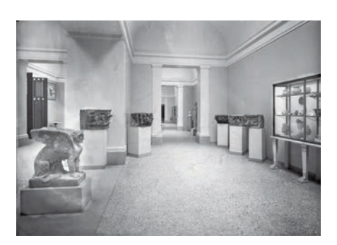
Antiquarium, room II, 1948 (Archivio Parco Archeologico di Pompei, A 603)