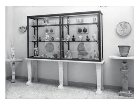
Antiquarium, room IV, 1914