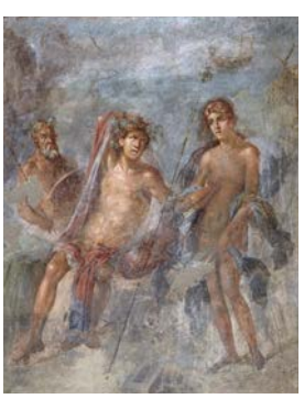
Dionysus and Arianna in Naxos Period of Nero (54-68 CE) Fresco House of the Golden Bracelet (VI 17, 42), triclinium