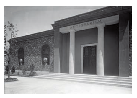
The façade of the Antiquarium, 1948