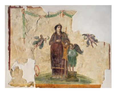
Venus Pompeiana with cupid 1st century CE Fresco House of Venus and the Four Gods (IX 7, 1)