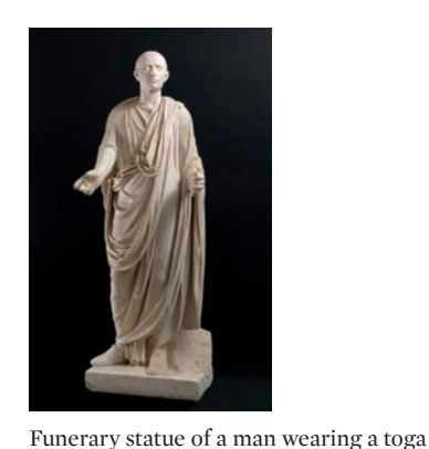
Ist half of the 1st century CE Marble Necropolis of Porta Ercolano, Tomb of gens Istacidia