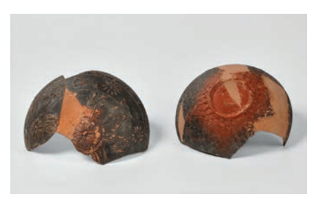
Relief bowls made in Asia Minor (western coast of Turkey) 140-100 BCE Terracotta Dump on the western side of the Forum