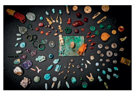
Treasure of amulets lst century CE Bronze House with the Garden (V, 2) Photo credits: Su concessione del Ministero per i Beni e le Attività Culturali e per il Turismo - Parco Archeologico di Pompei

Photo credits: Su concessione del Ministero per i Beni e le Attività Culturali e per il Turismo - Parco Archeologico di Pompei