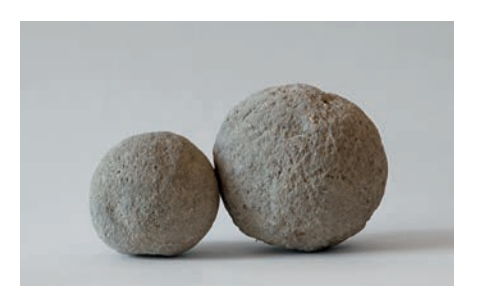
Projectiles from catapults 1st century BCE Lava