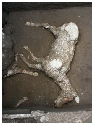
Copy of a cast of a horse from the excavation in Civita Giuliana polyurethane Boscoreale, Civita Giuliana