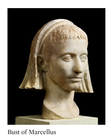
First half of the 1st century CE Marble Refuse under the House of Championnet (VIII 2, 1)