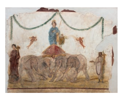
The goddess Venus standing on a quadriga drawn by elephants 1st century CE Fresco Feltmaker's workshop (IX 7, 5)