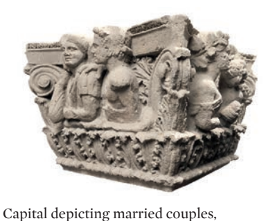
Satyrs and Maenads Second half of the 2nd century BCE Tufa House of the Figured Capitals (VII 4, 57)